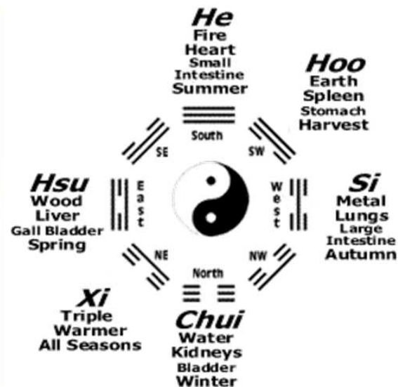
Figure 2. The Daoist Symbol.

A further refined understanding of Daoism [38, 49, 50, 51] in its full complexity initiated with the reissue of the Daoist canon (Daozang) in Shanghai in 1923-25. Daoist Canon of China (thread-bound edition) is shown in Figure 3. The canon is a gathering of about 1,500 texts which encompasses scriptures, commentaries, hagiographies, cultivation manuals, and liturgies. It was finished in 1445, it was actually the outcome of an intense compilation work over a number of decades and continued earlier gatherings of Daoist resources that went back as far as the fifth century C. E., but had been lost, burned, or else destroyed. Even this canon was secreted in the depth of monasteries and nearly forgotten, so that in the early twentieth century, only two sets of woodblocks persisted. The blocks were gathered and republished in Shanghai and the canon came to be reachable outside of