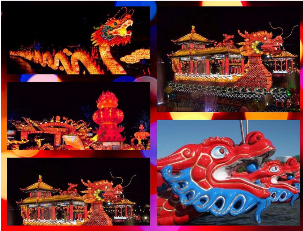
Figure 7. The dragon on festivals.

Dragon is also an emblem of power and authority. In Chinese history [26, 27], only the emperor can be entitled the son of Dragon.