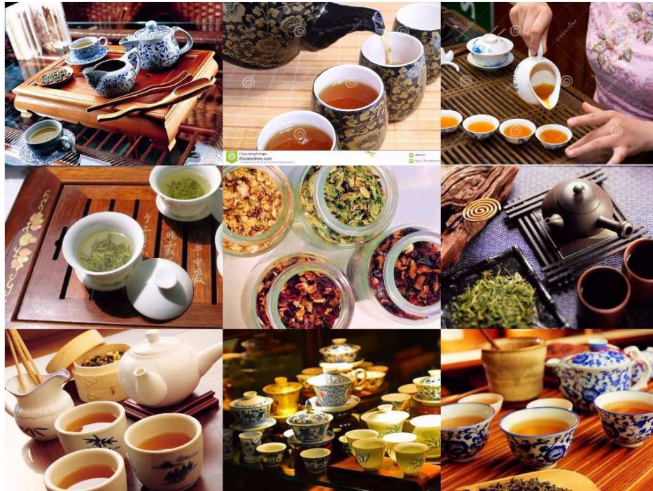
Figure 8. Some depictions of various tea culture are shown.