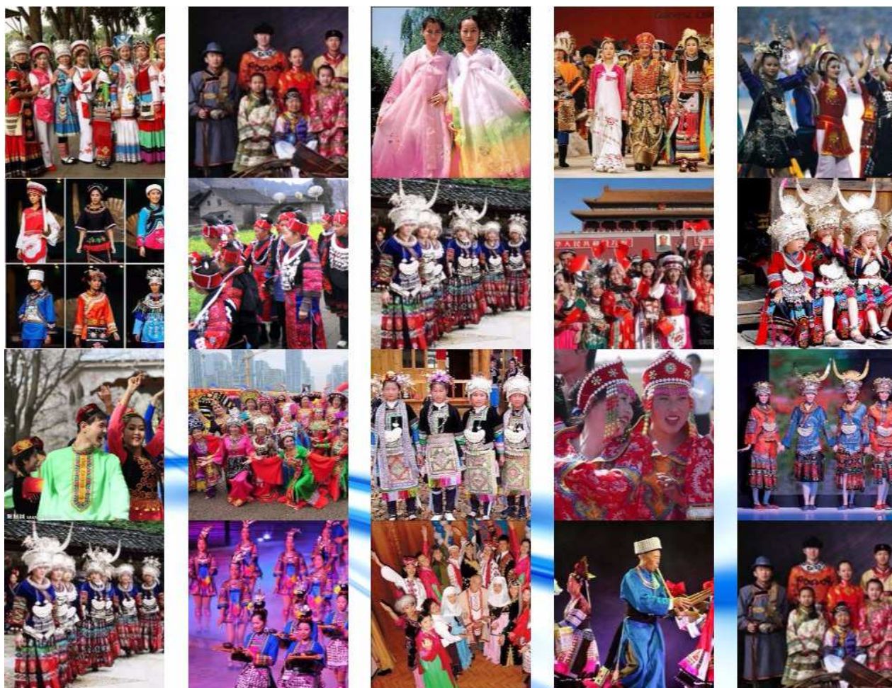
Figure 1. Various ethnic people of China.

Oroqen, Primi, Qiang, Russ, Salar, She, Shui, Tagik, Tatar, Tu, Tujia, Uygur, Uzbek, Zang, Zhuang, Achang, Bai, Blang, Deang. Another aspect is many inside the Han identity have retained distinctive linguistic and regional cultural [1, 3, 5, 9, 15, 19, 20, 26, 27, 29] traditions. Some of the ethnic people are as below in Figure 1. For ensuring that the 56 Chinese ethnic groups are breathing in an integrated way with peace and harmony, the government announced a series of policies like ones to secure the equality and unity of ethnic groups, give regional self-government to ethnic minorities and promote admiration for the faith and customs of ethnic groups. The terminology Zhonghua Minzu has been used to define the notion of Chinese nationalism at large. Much of the traditional identity inside the community has to do with differentiating the family name.