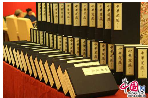
Figure 3. Daoist Canon of China (thread-bound edition).