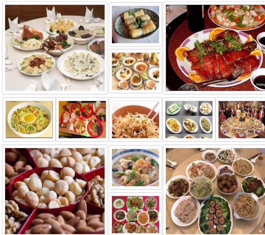
Figure 9. Some of the Chinese cuisines.

bun), and associated dishes of vegetables, meat, fish, or other items, renowned as cai (dish) in the Chinese language. Rice is a critical part of much of Chinese cuisine, in northern China, wheat-based products comprising noodles and steamed buns preponderated. Some of the Chinese cuisines are shown in Figure 9.