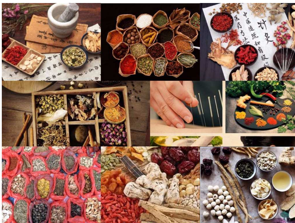
Figure 12. Some Traditional Chinese Medicines (TCM).

in terms of diagnosis, treatment and its composition of drugs and prescriptions. Traditional Chinese Medical Science is as per yin-yang and the five element theory. The theories are metal, wood, water, fire and earth. Human body is considered an integration of essence, energy and spirit. Chinese doctors of traditional medicine proceeds with the holistic approach for diagnosing. They consider the whole body of the patient: his/her food, age, lifestyles, feelings, habits and living environment. They pay specific consideration to the reasons of the sickness instead of the symptoms. Four common diagnostic are: Listening, Smelling, Inquiring and observing and Feeling the pulse. Some of the Traditional Chinese Medicine (TCM) are shown in Figure 12. Acupuncture is a practice of alternative medicine, which is a fundamental constituent of traditional Chinese medicine (TCM) encompassing thin needles inserted into the body at acupuncture points. It can be accompanying with the application of heat, pressure, or laser light to these same points.