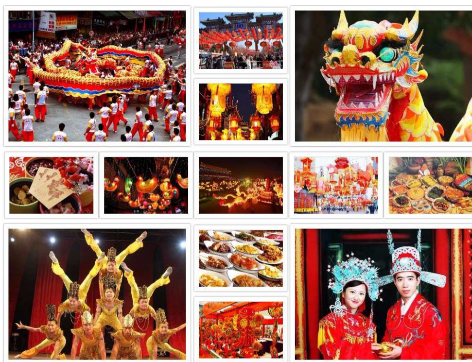
Figure 10. Some of prominent festivals in China.

Some of prominent festivals in China are- Spring Festival, Lantern, Tomb-sweeping Festival, Dragon Boat Festival, Spring Festival Gala, Mid-autumn Festival, Double Ninth Festival, and Intangible Cultural Heritage [1, 3, 5, 9, 15, 19, 20, 26, 27, 29]. Some snaps of the Chinese major traditional festivals are shown in Figure 10.