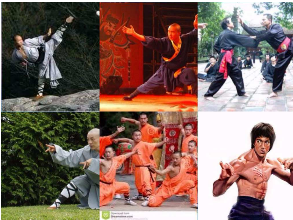
Figure 6. Various types of martial artists.

Due to the reason of inclusion of diverse aspects, for example natural state and social scope, fighting exercise and health care, intensive exploration on Gongfu could lean-to an exclusively new light on these correlated phenomena in an intercultural perspective. Legendary and debated moves like Dim Mak are applauded throughout the world and this art co-existed with a variability of weapons comprising the more standard 18 arms and spoken about within the culture. The first generation of art was in full swing for the importunity of survival and warfare more than art [24, 30]. Time to time, some art forms have branched off, whereas others have taken a distinctive Chinese flavor. China has produced some of the most prominent martial artists together with Wong Fei Hung and many others as shown in Figure 6. If Gongfu research commence with the aesthetic method, to be precise "perceptually comprehensive method", the profundity of specifically multi-gradation and multi-orientation with its intercultural importance can be enlightened in a congruently simply way, it is advanced as a new subject and becoming a new pathway for contemporary international academia.