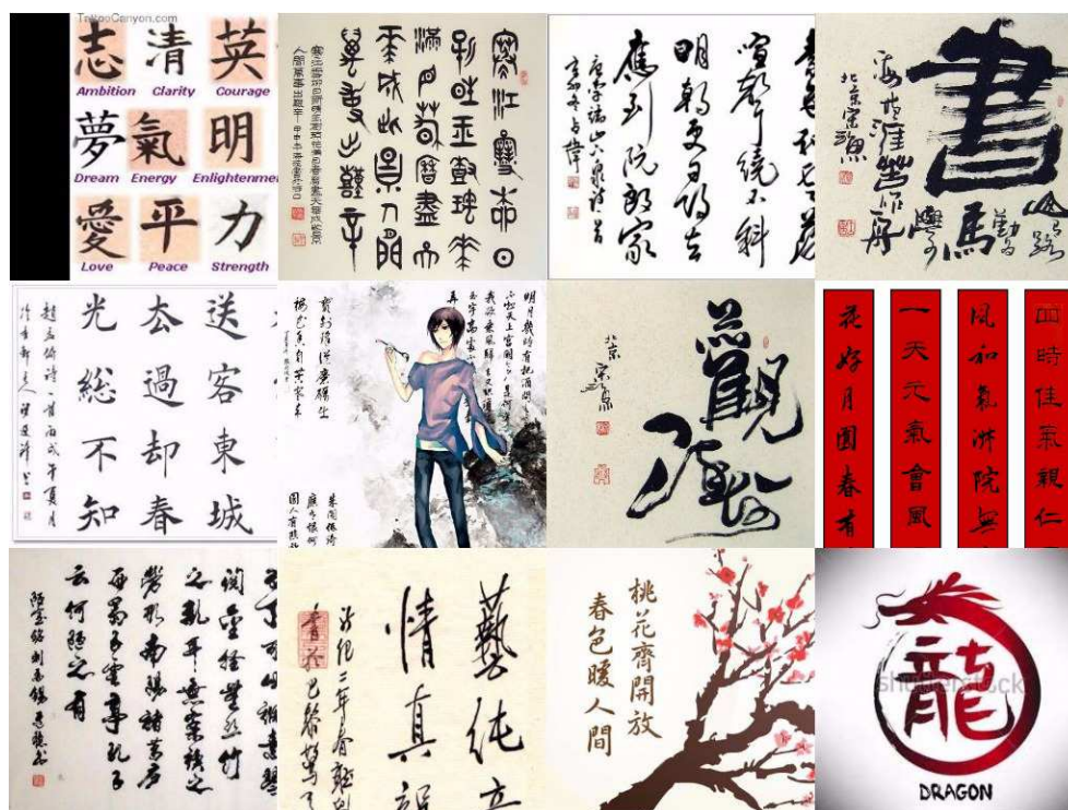
Figure 5. Some calligraphies.

from the tomb of the King of Chu in Changsha (Central China's Hunan Province), are the ancient existing drawings in China and the world. Chinese painting [12] sustained to progress throughout the Eastern and Western Jin Dynasties (265-420), and prospered throughout the Sui (581-618), Tang (618-907), Song (960-1279), Yuan (1271-1368), Ming (1368-1644) [25] and Qing (1644-1911) Dynasties [21, 22, 33, 34, 35, 36, 37]. Early Chinese music was with percussion instruments, which later were with stringed and reed tools. By the Han dynasty papercutting came to be a new art form afterward the creation of paper. Chinese opera would also be presented and branched provincially in addition to other enactment formats such as variety arts [24, 30]. Chinese calligraphy and painting [21, 22, 23, 28, 33, 34, 35, 36, 37], which acted and advanced in tandem, are the directorial power of China's fine arts [24, 30] and Chinese calligraphy embody China's humanist spirit, and indeed these are unparalleled in the arts of the world. China has the ultimate antique calligraphic tradition. The Chinese system of writing that use pictographs in place of alphabets, has been in presence for some thousand years and is not only a manifestation of Chinese culture, but also one of the marked endeavors of early human civilization. Some calligraphies are shown in Figure 5.