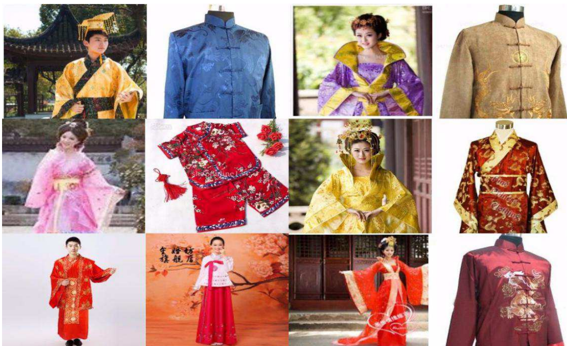
Figure 11. Some of type of dresses.