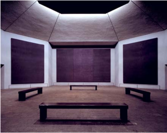
Figure 5. Rothko Chapel, Houston, TX.

Developed artworks with metaphysical dimensions, like in Rothko's paintings, suppose that the artist has to create with his work, places in nature and in life where elements and forms build new spatial realities, available not only for senses but for consciences. Empty places, which immobile spaces had been activated to be receptor and which have as a purpose, when in life and nature, to define limits in which consciences can move, or, in other words, artwork-person relations with their own being.