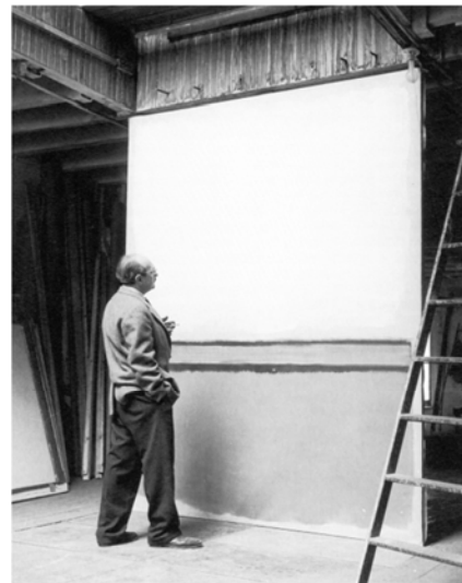
Figure 3. Rothko contemplating the painting N° 25 (1951), c. 1952. [50].