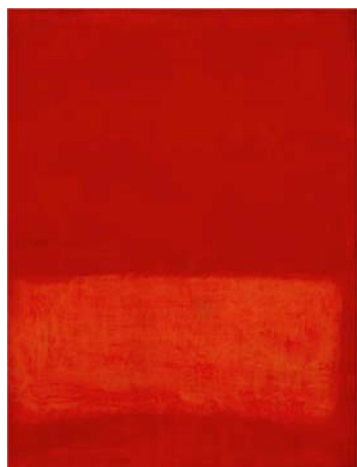
Figure 1. Untitled, 1969. Marc Rothko. University of Navarra Museum.

1 a Mark Rothko's work made in 1969 that belongs to the American abstract expressionism movement are taken as examples. [19] The artwork is today in the Navarre University Museum collection (Figure 1).