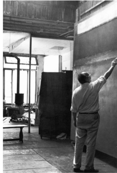
Figure 2. Rothko in his studio on West 53rd Street, around 1953. Photo by Henry Elkan [46].