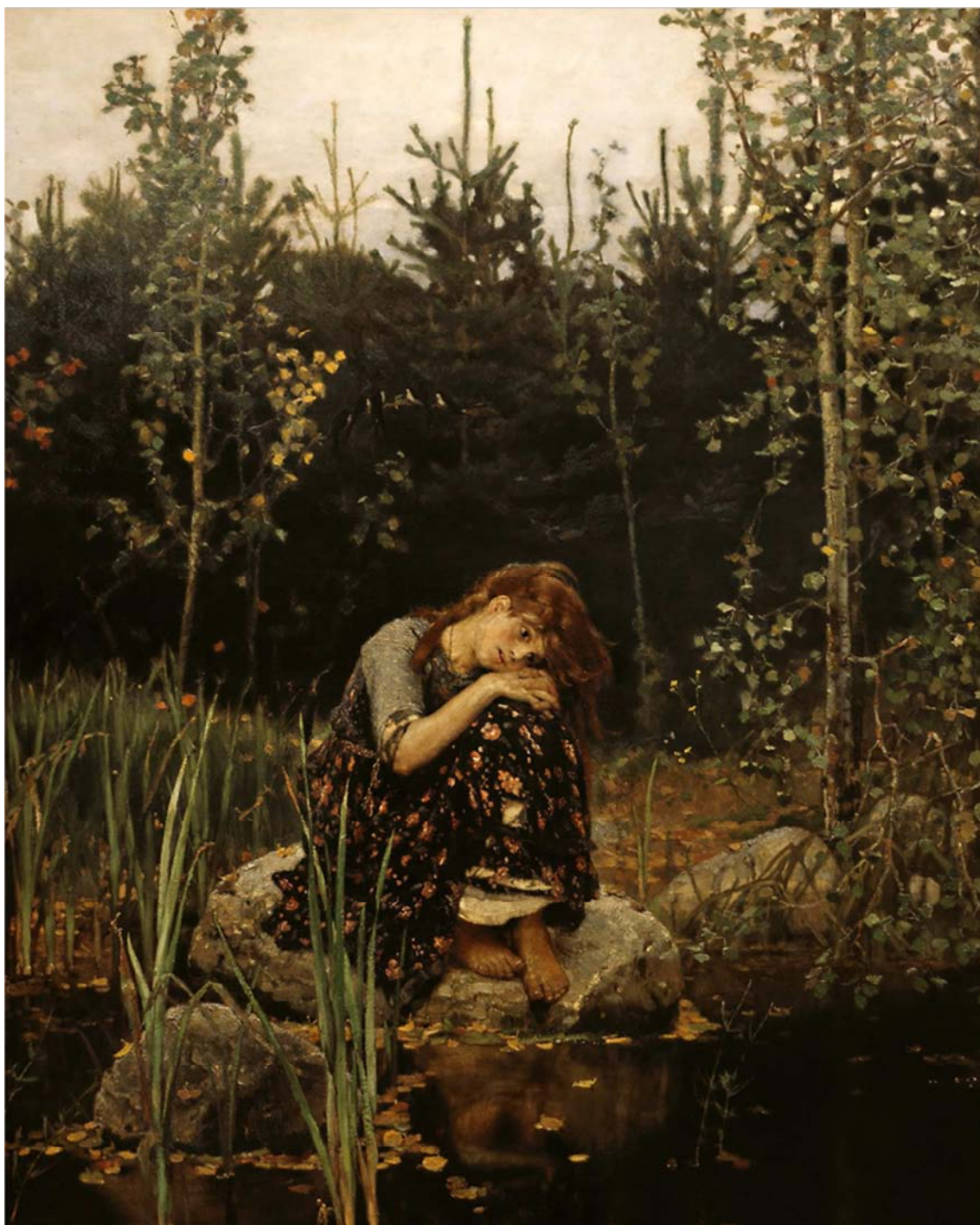
Figure 4. Victor Vasnetsov - "Alyonushka".