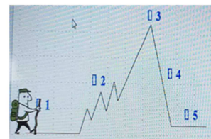
Figure 2. Elements of A Novel & Plot Development Stages.

A1-1: (1) instruction on “the plot of a novel”; (2) reviewing a previous text, Amy Tan’s novel (excerpt) Two Kinds , in terms of its plot development; (3) pair discussion: the plot of the story in this unit, trying to use the key terms to describe plot development, such as “exposition, the rising action, climax/crisis, the falling action, denouement/resolution, chronological, flashback”. The teacher’s instruction is supplemented by diagrams (see Figure 2), and through question-and-answer interaction, students are encouraged to keep thinking and begin the “internalization” process as soon as possible.