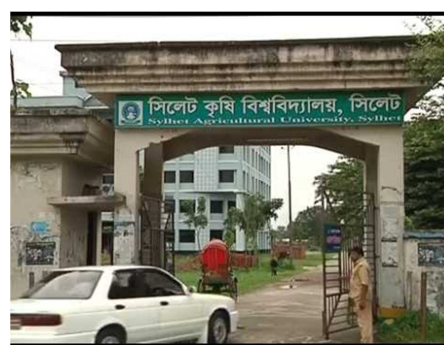
Figure 1. A part of Sylhet Agricultural University Campus.

perspectives in Bangladesh as well as abroad through excellence and innovation in teaching and learning, research and knowledge exchange. It is also contributing to the encroachment of society and the development of leaders through a global presence, regional significance and engagement with the rational activities to fill the demand of time.