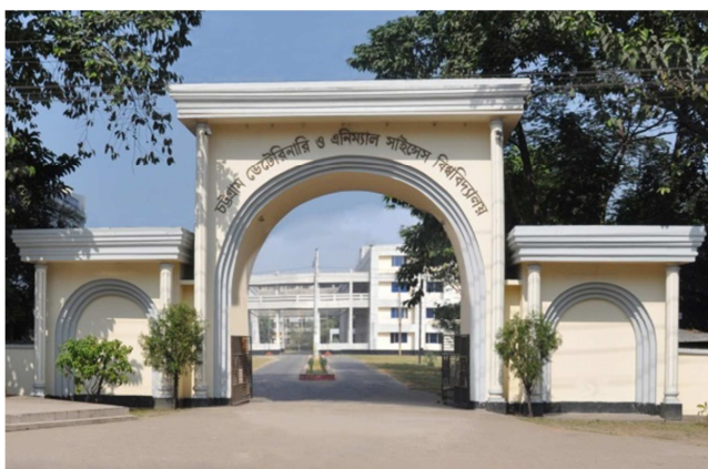
Figure 3. A part of Chattogram Veterinary and Animal Sciences University Campus.

There are three faculties; Faculty of Veterinary Medicine, Faculty of Fisheries and Faculty of Food Science and Technology at this university. Two Courses on English Language are offered to each faculty as Compulsory Course; Communicative English (Theory+Practical).