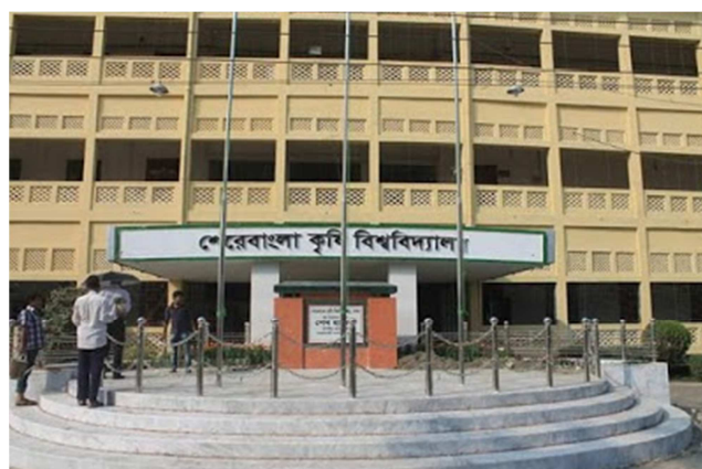
Figure 4. A part of She-re-Bangla Agricultural University Campus.

This university was established for the expansion of higher agricultural education and committed to promote research in various fields of agricultural sciences and to offer extension services.