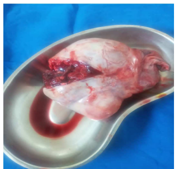
Figure 2. Ruptured testis, Testicular Seminoma, Female, Ambiguous Genitalia, Dr. Sulman Alamin Medical Center, Gezira State, Sudan; 2023.