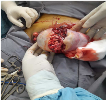
Figure 1. Intra-operative, Ruptured Testicular Seminoma, Female, Ambiguous Genitalia, Dr. Sulman Alamin Medical Center, Gezira State, Sudan; 2023.

testis or an ovary, (3) Buccal biopsy for sex determination and (4) Surgery, for the right side, if needed.