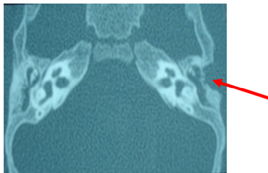
Figure 1. CT scan of temporal bones (axial view): filling of the left middle ear; lysis of the scale of the temporal, thickening of soft left temporal parts.

Temporal MRI showed bilateral inflammatory filling of the middle ear complicated with a collection of left external soft temporal parts (Figure 2).