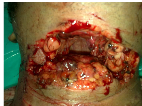
Figure 1. Suicidal incision- horizontally positioned anteriorly placed.

Homicidal cases had obliquely positioned incisional wounds that were more laterally placed in neck with multiple wounds indicating that the victim had engaged the assailant in self-defence. Restoration of normal pharyngeal and laryngeal architecture without compromise of food passage and airway was carried out through meticulous surgical repair of various tissue layers Fiureg 2, 3.