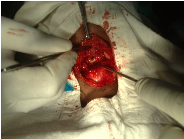
Figure 2. Restoration of laryngeal framework.