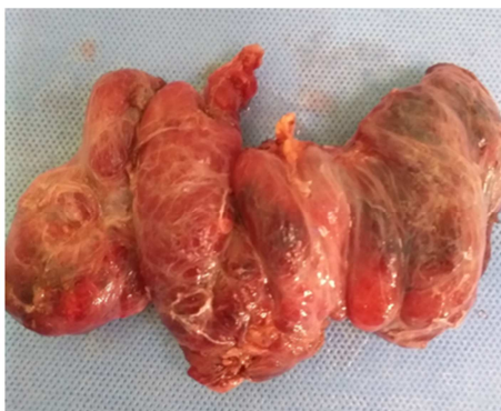
Figure 2. Isolated thyroid specimen following the thyroidectomy.

Concerning therapeutic management, Total thyroidectomy was performed for the goiter (figure 2). The histopathology revealed a dystrophic adenomatous thyroid hyperplasia without signs of malignancy and the patient is on substitution therapy.