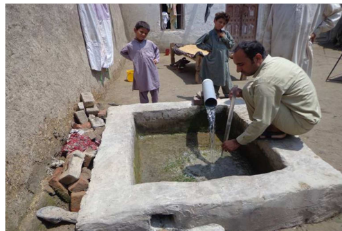
Figure 1. Water pump in open area.

laboratory by using DelAgua testing kit and Quantofix arsenic kits. As per field findings, the following water sources exist in the area of intervention; Motorized borehole, PHED Schemes, Open well, shallow hand pumps and borehole with Natural water flow