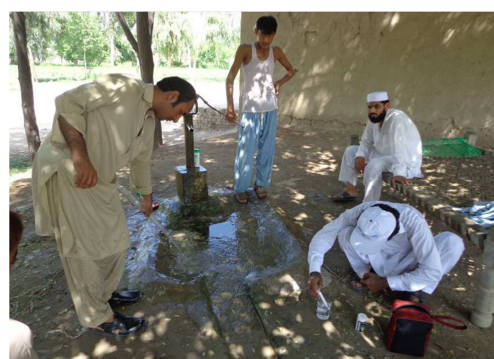
Figure 4. Communal Hand pump.