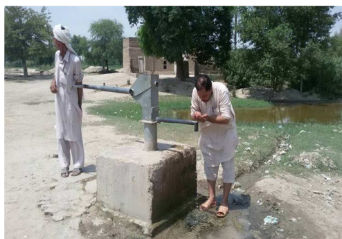
Figure 2. Water hand pump by community.