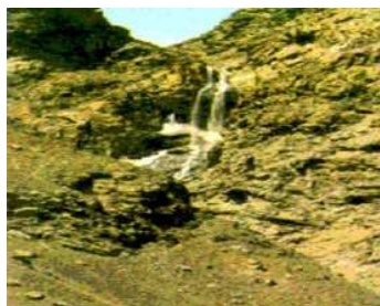
Figure 1. Fragment from the site of the research object.

In irrigated areas in Azerbaijan, the irrigation erosion of the growth of the country's economy causes great damage. The development of mountain and piedmont arrays with non-compliance with erosion control measures, contributes to an increase in the intensity of soil washout, which adversely affects yields and often causes the land to exit from agricultural processing.