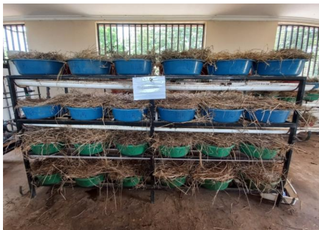
Figure 1. Experimental Setup for Red Worm Culture.

Four (4) kg of the dry substrate was measured using a weighing balance and then added to each experimental container and thoroughly mixed with water, then experimental containers were covered with enough dry grasses at the top to block direct sunlight and maintain moisture. The plastic containers used to culture red worms had a gutter at the bottom to collect the vermiliquid /vermiwash. The mixture was kept in this form for three weeks to allow for decomposition before inoculation of the red worms into the respective substrates. To keep the desired range of moisture content of the culture substrates during the experimental period, wetting was done twice per week using one litre of water from the fish pond per each experimental container [25] and there was no addition of chicken manure, cow dung manure or rabbit manure during the production cycle.