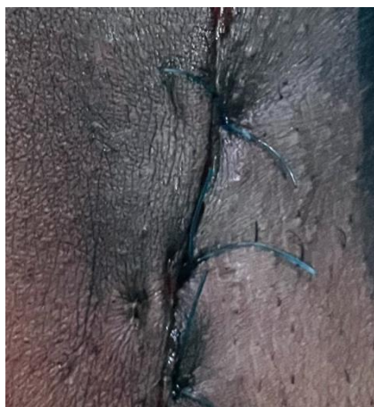
Figure 6. Skin closure.