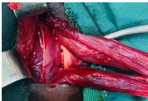
Figure 3. Suture of the medial lip of the external oblique muscle fascia to the crural arch and incision on this sutured fascia (flap).