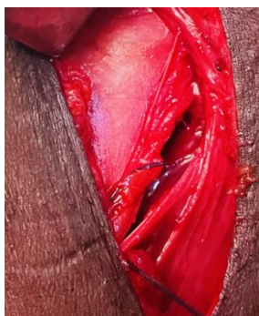
Figure 5. Closure of the external oblique fascia anterior to the cord (top).