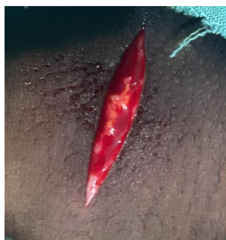
Figure 1. Skin incision.

Finally, the skin was closed in the conventional way (figure 6).