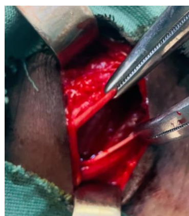
Figure 2. Incision of the aponeurosis of the external oblique muscle.