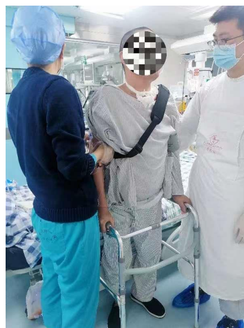
Figure 2. Record of the patient's recovery.

On April 26th, the patient underwent a spontaneous breathing trial (SBT) and was able to be off the ventilator for 6 hours. Under monitoring, the patient could independently sit for 5-10 minutes. Additional exercises were introduced, including resistance band training for the limbs, sitting-to-standing training, and assisted standing with two people - 10 minutes per session (Borg score between 11-14, heart rate < HR rest + 20 beats/min, blood pressure < +20 mmHg). On May 5th, another SBT was conducted, and the patient was able to be off the ventilator for 12 hours. On May 11th, the patient underwent another SBT and was able to be off the ventilator for 24 hours.