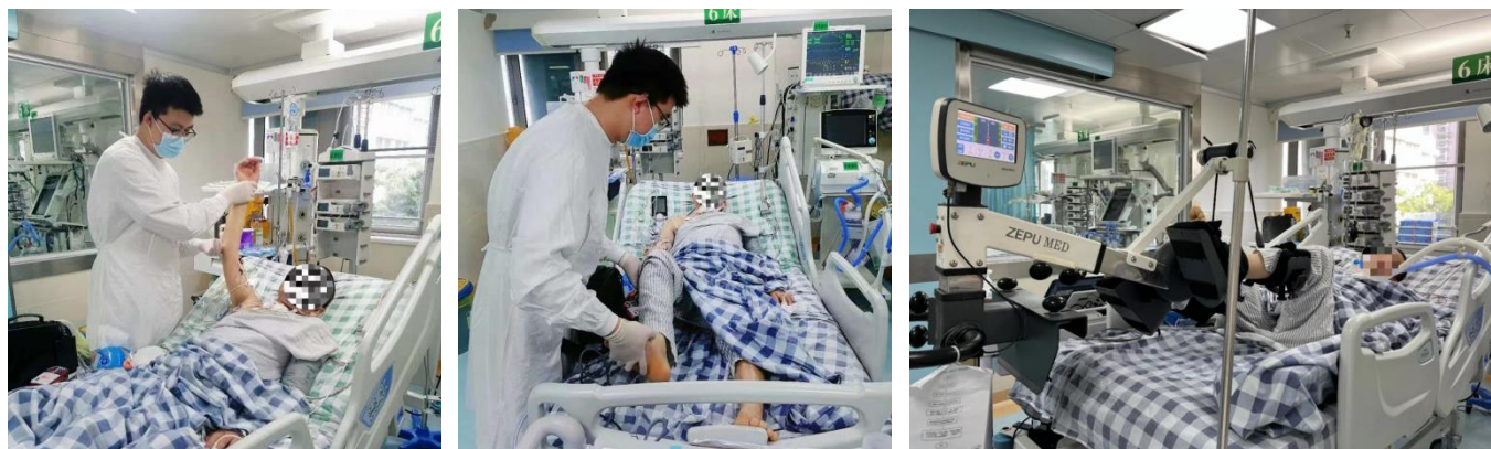
Figure 1. Record of the patient's recovery.

On April 15th, the patient was alert, able to follow instructions for movement, and vital signs were stable. The patient continued to receive assisted ventilation with the SIMV+PS mode, FIO 2 : 45%, PEEP: 5 mmHg. According to the plan from the University of Leuven, the patient is categorized as Level II, and the following rehabilitation treatments were administered: