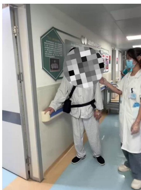
Figure 3. Before being discharged from the hospital, the patient demonstrated the ability to ambulate with minimal assistance.

S5Q: Standardized Five Questions; MRC: medical research council Scale; RASS: Richmond Agitation and Sedation Scale; IMS: ICU Mobility Scale; BBS: Berg balance scale