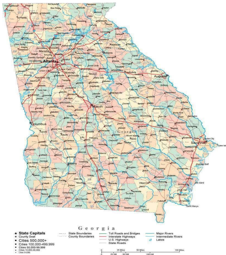
Figure 3. Map of Georgia with Cities, Interstate Highways, Roads, Rivers, and Lakes.