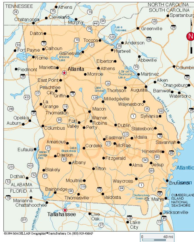
Figure 2. Map of Georgia Major Cities.