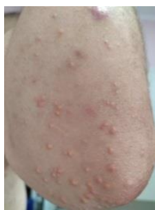
Figure 1. Multiple miliar to lenticular firm yellowish papules on the left elbow.

A 34-year-old man presented with a sudden onset of mildly pruritic, multiple, clustered, yellowish, firm, raised skin papules on the elbows (Figure 1). He reported consuming a significant amount of alcohol systemically (approximately 750 ml of concentrate daily) for at least one year. There was a positive family history of hereditary hyperlipidemia and diabetes mellitus. The patient was obese, with a body mass index of 38 kg/m 2 and had arterial hypertension (average blood pressure 150/95 mmHg). Laboratory findings revealed elevated hyperglycemia, liver function tests indicating hepatocellular damage (AST 62 IU/L, ALT 223 IU/L, GGT 108 IU/L), increased acute inflammatory markers (ESR 80 mm/h), and dyslipidemia (total cholesterol 8.9 mmol/L, triglycerides 6.34 mmol/L). Histological examination demonstrated compact conglomerates of lipid-laden macrophages with foamy and vacuolated cytoplasm in the dermis (Figure 2), consistent with eruptive xanthomas. Abdominal ultrasound revealed hepatosplenomegaly, nephrolithiasis in the left kidney, chronic pancreatitis, and cholecystitis. The patient underwent systemic antidiabetic therapy with metformin and hepatoprotective therapy with ademetonine. A strict low-fat and low-carbohydrate diet was advised, and alcohol use was discontinued. At the 2-month follow-up, there was partial resolution of skin lesions with a decrease in blood sugar to 5.5 mmol/L, total cholesterol to 5.2 mmol/L, and triglycerides to 1.4 mmol/L.