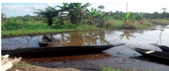
Figure 3. Crude oil spills polluted fishing lake.

The youth leaders said, Agip told them when they were laying the pipeline (the OB/OB-Ogboinbiri 24 inches pipe), that the pipeline is to transport gas to their terminals in order to stop gas flaring. But when vandals tempered with the so called gas pipeline, what comes out was crude oil, not the gas they talked about. They were transporting crude oil in the name of gas. The pipeline construction commenced 2005, and was handled by Daewoo oil servicing company, and the job was completed in 2008. Figures 3-10 shows some impact of crude oil spills on land and water bodies in Oporoma community.