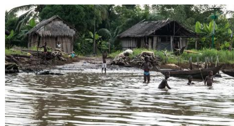
Figure 9. Children bathing on crude oil spills contaminated river.