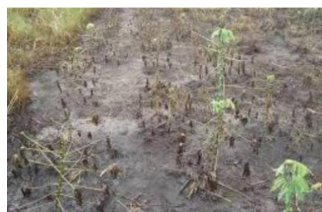
Figure 8. Crude oil spills destroyed cassava farm land.