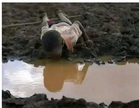
Figure 10. A child drinking from crude oil spills contaminated water.

Figures 3-10: Some Impacts of Crude Oil Spills both on Land and Water Bodies in Oporoma Community.