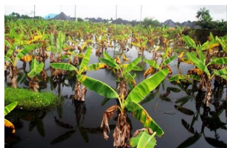
Figure 7. Crude oil spills destroyed plantain farm land.