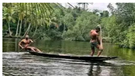
Figure 6. Fisher men carrying out their fishing business in a crude oil contaminated river.