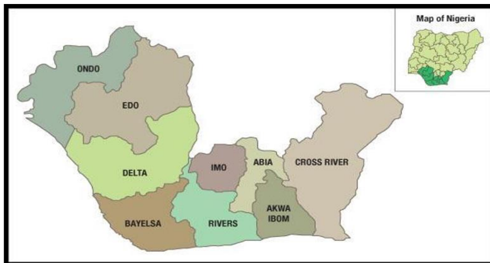
Figure 1. The Nine States that Made up of Niger Delta Region [37].

leaked roughly 324,000 bbl of crude oil in about 1500 incidents. According to SPDC, of the overall amount of oil that spilled from SPDC installations in 2013, about 75% is due to sabotage/theft, and 15% due to operational spills resulting from corrosion, equipment failure, or human error.