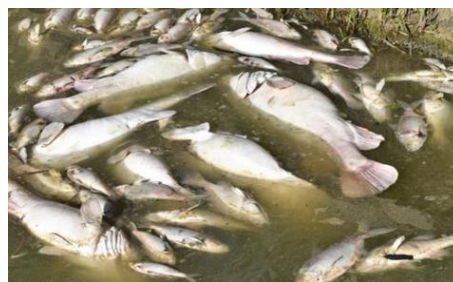
Figure 5. Crude oil spills killed fishes.