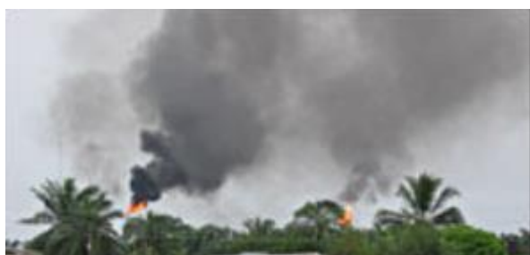
Figure 11. Air pollution from gas flaring.

Gas flaring actually have dangerous impact on the livelihood and health of the people of Oporoma community, as it releases poisonous chemicals into the environment, including; nitrogen, sulphur dioxide, volatile organic compounds e.g benzene, toluene, xylene, hydrogen sulphide, and carcinogens e.g benzopyrene and dioxins. Exposure to these substances can lead to respiratory problems. These chemicals can magnify asthma, cause breathing difficulties and pain, as well as chronic bronchitis. Benzene, known to be emitted from gas flares in undocumented quantities, is well recognized as it causes leukemia and other blood related diseases. A research carried out by Climate Justice, reveals that exposure to benzene can lead to eight new cases of cancer annually in Bayelsa State only (Gas flaring in Nigeria).