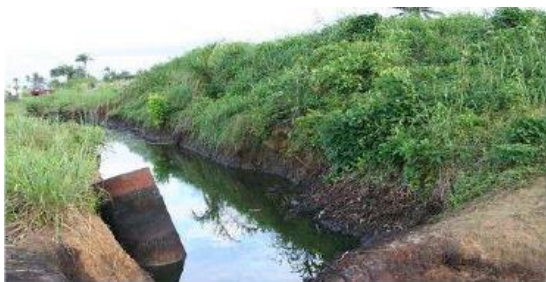
Figure 4. Crude oil spills polluted stream.