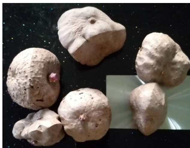
Figure 1. Dioscorea bulbifera bulbils.