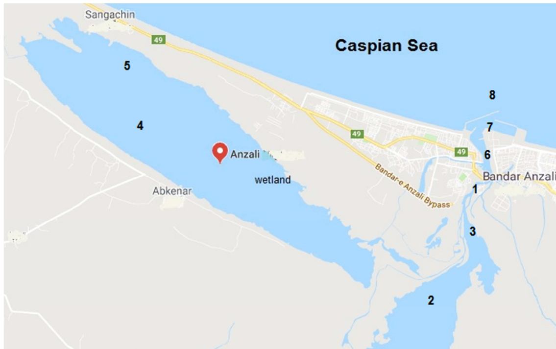
Figure 1. Map of the study area and sampling stations in the Anzali wetland, Iran.

For experiment, first Methylen blue, chloroform and propionol solution has been supplied. Extraction and measurement of surfactants has been performed by methylen blue method and, spectrophotometry has been performed by year method [4]. Methylen blue and surfactant has created complex that is more stable in pH 8 or 8.2 and extraction has been performed by decanter cone with mixture of Methylen blue, chloroform and propionol solution 1: 5: 5 and 12.5 and has been mixed severely in 30 seconds until liquid and organic phase will be separated and extraction will be repeated with adding 5 ml chloroform and chloroform add to other cone and 25 ml washing solution added to other cone and mixed severally in 30 seconds, and after mix of two other phase, separation has been performed in any stage by 5 ml chloroform. Organic phase has been transfered to JoJeh ballon and final solution volume become 50 ml, then by spectrophotometer device in wavelength 652, sample attraction was declared.