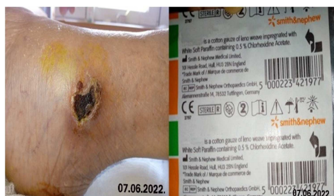
Figure 9. Pressure ulcer with irregular edges filled with non-viable tissue and non-adherent dressing with antiseptic.

A 75-year-old female patient with a pressure ulcer on the lateral side of the left lower leg. The patient is a chronic heart patient, immobile due to left hemiplegia after a cerebrovascular insult. The patient's family insists that pressure ulcer debridement be performed at home.