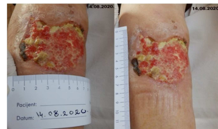
Figure 1. Chronic leg ulcer in the inflammatory phase of wound healing.

A 51-year-old female patient presents to her family doctor because of a chronic wound-ulcer caused by an injury to the back of her left lower leg. On examination, she is conscious, oriented and mobile, with no significant health problems. The patient is originally from a rural area, significantly far from her home healthcare institution, and insists that the treatment of the chronic wound be carried out in the outpatient clinic of the family doctor.