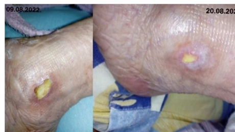
Figure 11. Healing of a chronic wound with autolytic debridement, performed in home conditions.

11.06.2022. Paraffin dressing impregnated with an antiseptic is used as a primary dressing, while cotton gauze is used as a secondary dressing.