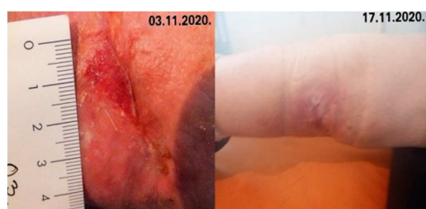
Figure 4. Remodeling phase of chronic wound.

25.09.2020. Debridement of a chronic wound with a polyurethane foam dressing, with prior obligatory cleaning of the wound with a saline solution. A chronic wound of an irregular shape filled with granulations due to the establishment of angiogenesis and the synthesis of cells necessary for granulation and the formation of epithelium on the edges of the wound. The wound is almost twice as small compared to the start of treatment in mid-August 2020.