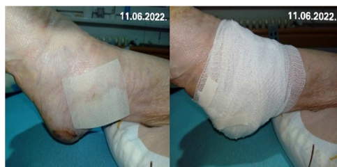
Figure 10. Primary (paraffin) and secondary dressing (cotton gauze) in the treatment of chronic wounds.

07.06.2022. Decubitus on the lateral side of the left lower leg. Debridement is carried out by applying a paraffin dressing impregnated with chlorhexidine with prior cleaning of the decubitus with saline solution. The lining is changed every third day.