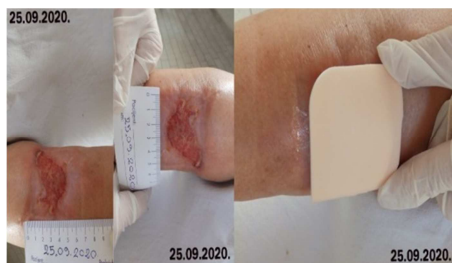
Figure 3. Autolytic debridement with polyurethane dressing in the family doctor's office.

precisely because of debridement, which achieves the concept of "controlled humidity", that is, by establishing a moist environment using modern polyurethane foam dressing. Chronic wound debridement is continued by cleaning the wound with the application of a modern dressing that is changed every fourth day.