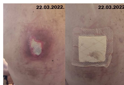
Figure 5. Polyurethane foam adhesive border dressing on pressure ulcer.

22.03.2022. Second-degree decubitus ulcer localized on the patient's back.[17, 22] A decubitus ulcer is irregular in shape, filled with fibrin and locally discolored skin that is dark red in color. Treatment of the decubitus ulcer is started immediately with the topical application of fusidic acid locally and debridement with a polyurethane foam dressing.