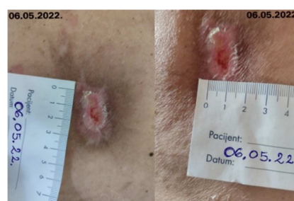
Figure 7. Migration of epithelial cells from the edges of decubitus.

08.04.2022. Decubitus ulcer after two-week debridement with polyurethane dressing. The decubitus takes an elliptical shape, the edges of the decubitus are regular while the wound bed is filled with fibrin deposits. The ulcer itself is significantly smaller in size. Periwound, on the skin, the edges of the placed dressing are visible, which is now shaped in accordance with the size and dimensions of the ulcer. Also, the periwound skin color changes from dark red to a normal color. After the initial topical application of fusidic acid, debridement continues with the cleaning of the chronic wound and the application of a modern dressing.