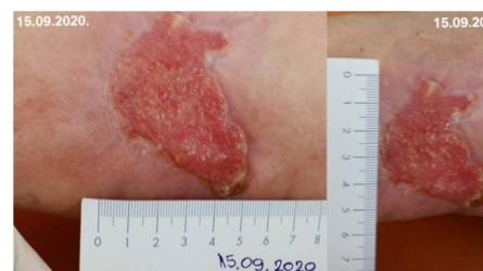
Figure 2. Proliferation phase with the granulation tissue in the wound bed.

14.08.2020. Chronic wound of the back of the left lower leg after an injury. The wound has irregular edges, the wound bed is filled with granulation tissue with fibrin deposits. The patient is advised to debride the chronic wound with a polyurethane dressing with topical application of fusidic acid.