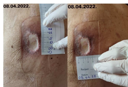
Figure 6. Decubitus with regular edges with a fibrin deposit in the wound bed after two-week debridement.

22.03.2022. Second-degree decubitus ulcer localized on the patient's back.[17, 22] A decubitus ulcer is irregular in shape, filled with fibrin and locally discolored skin that is dark red in color. Treatment of the decubitus ulcer is started immediately with the topical application of fusidic acid locally and debridement with a polyurethane foam dressing.