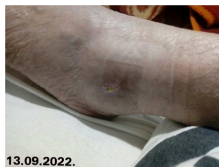
Figure 12. Chronic wound almost completely closed by the concept of moist wound healing.

09.08.2022/20.08.2022. Decubitus ulcer after a two-month debridement with a paraffin dressing impregnated with an antiseptic. It is twice as small in size with a tendency to heal and close chronic wound.