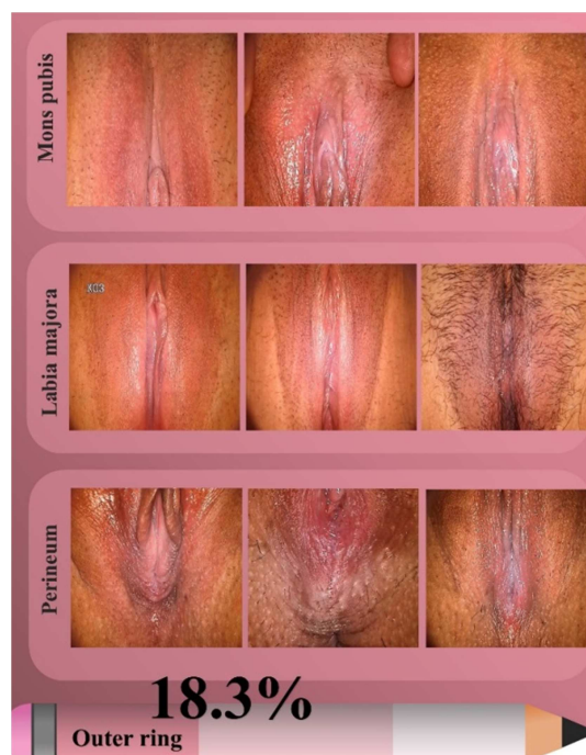
Figure 1. Distribution of nonspecific lesions in the outer vulvar ring in patients diagnosed with vulvodynia.

A detailed distribution of nonspecific lesions in the outer vulvar ring in patients with and without vulvar discomfort is shown in Table 1.