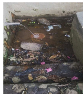
Figure 4. Protected spring water point showing potential sources of water contamination.