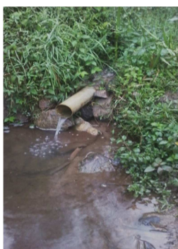
Figure 2. Protected water point without a perimeter fence in Central Division.

The results obtained after collecting data with the inspection checklist shows that although proper sanitation was kept around various water points and toilets were located far from the water sources, but all the forty-eight spring water sources still faced some risks of contamination with bacterial fecal organisms in all the three divisions. The results indicates that the main sources of contamination of the springs in the three divisions were absence of a Perimeter fence, presence of cracks or dirty drainage channels, location of water points downhill which exposed the water to washed wastes and contaminants, dirty unclean water collection containers used by the people to fetch water for drinking and domestic use and washing of legs, clothes and containers around the water points by the people.