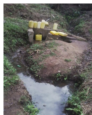
Figure 3. Unprotected spring water point in Ishaka Division.

Some of the water points were channeled with a plastic pipe to direct the flow and easy collection of the water by the inhabitants (figures 2, 4 & 5) while some were not channeled with a pipe (figure 3). Some water collection points had no protection against man, animal, agricultural and bacterial activities/wastes which may be washed or dumped into the water (figures 2 & 3). Most of the water collection points were protected with perimeter fence/wall and the water was properly channeled with a pipe but the surrounding was still exposed to contaminants like organic waste, wrappers, debris and animal matter (figure 4). Human activities like washing of clothes, legs and other items were also observed in some water collection points. (Figure 5).