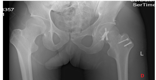
Fig. 3. A typical case: a 27-year-old man with Pipkin type I fracture dislocation left femoral head (A), plain radiograph and CT (B–C), he was managed by open reduction and Herbert screws fixation through TFO (D).