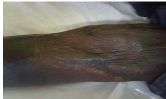
Figure 6. Wounds fully healed at six months of follow up.