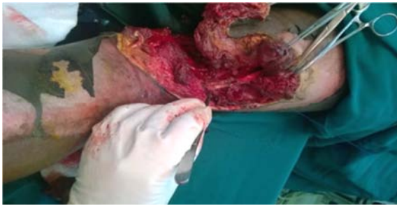
Figure 2. Wound post surgical debridement, sciatic nerve defect about 12 centimetres.

A Sural nerve graft of about 30 cm in length was harvested from the contralateral leg. [figure 3]. The nerve was cut into two parts with one coapted into the lateral aspect of the sciatic nerve and the common peroneal nerve and the other the medial aspect of the sciatic nerve and the tibial nerve. Medial gastrocnemius muscle was raised as a pedicle flap and utilized to cover the neurovascular structures. [figure 4]. The muscle and the burnt areas were grafted at the same sitting with good graft take [figure 5]. At six months of follow up the wound had fully healed and no contractures were noted. [figure 6]. Post operatively the knee was splint with a knee cast. The Patient was commenced on physiotherapy two weeks after surgery. Nerve recovery was assessed by the progression of the Tinel sign, motor and sensory response. At six months of follow up the patient had knee flexion followed by recovery of the foot drop after one and a half years of follow up. [figure 7]. Sensory recovery over the heel and dorsum of the foot was noted at about one year of follow up.