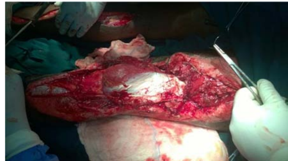
Figure 5. Soft tissue coverage over the repaired Nerve.