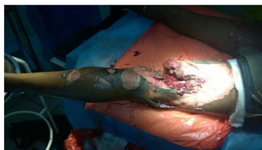
Figure 1. Patient with post thermal soft tissue loss and sciatic nerve injury.

was reconstructed in a one stage surgical procedure. At surgery he was found to have a wound involving the posterior aspect of the knee and lower thigh of about 15cm by 20cm in dimensions (figure 1).