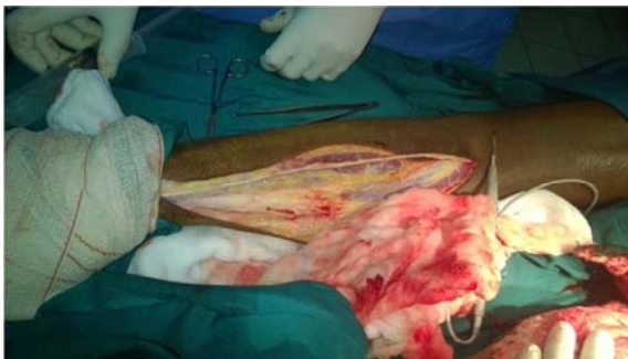
Figure 3. Sural nerve graft identified and being harvested from the contralateral leg.

A Sural nerve graft of about 30 cm in length was harvested from the contralateral leg. [figure 3]. The nerve was cut into two parts with one coapted into the lateral aspect of the sciatic nerve and the common peroneal nerve and the other the medial aspect of the sciatic nerve and the tibial nerve. Medial gastrocnemius muscle was raised as a pedicle flap and utilized to cover the neurovascular structures. [figure 4]. The muscle and the burnt areas were grafted at the same sitting with good graft take [figure 5]. At six months of follow up the wound had fully healed and no contractures were noted. [figure 6]. Post operatively the knee was splint with a knee cast. The Patient was commenced on physiotherapy two weeks after surgery. Nerve recovery was assessed by the progression of the Tinel sign, motor and sensory response. At six months of follow up the patient had knee flexion followed by recovery of the foot drop after one and a half years of follow up. [figure 7]. Sensory recovery over the heel and dorsum of the foot was noted at about one year of follow up.