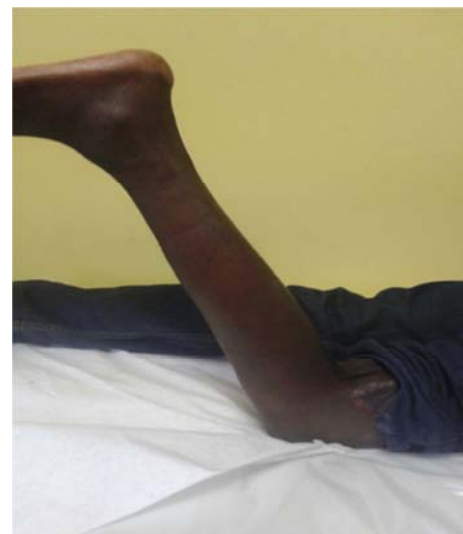
Figure 7. Patient able to flex the knee against gravity at six months of follow up.