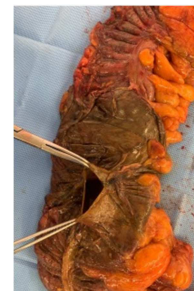
Figure 2. Gangrenous colon with perforation.

All patients received steroids (hydrocortisone, methylprednisolone), Noradrenaline, hydroxychloroquine, antivirals (Favipiravir or Kaletra), one patient only received IL 6 inhibitor.