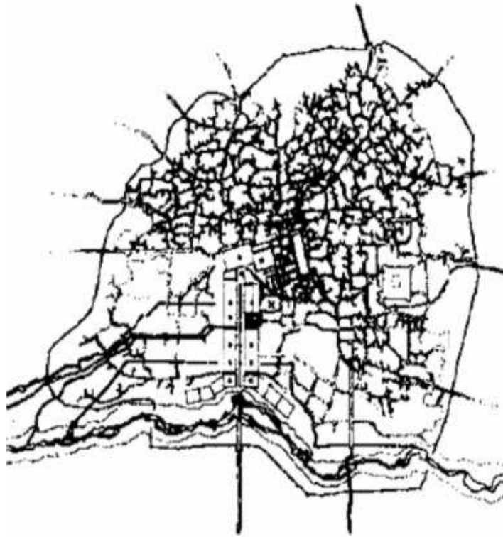
Figure 1. Isfahan Downtown in Safavid Period.

Traditional methods influenced by the Islamic mystic perspectives, as well as modern methods, were more commonly used in the construction of mosques and schools, but in public buildings, the modern methods were applied [32]. Generally, in this period, the buildings had the forms and structures popular in the Seljuk period, but due to the dominance of Mongols, new scale and magnificence appeared in them, and decoration of the buildings has been specially paid attention. Most of the buildings were constructed in a 4-iwan form with tall iwans having the portals ornamented by Muqarnas and the ornaments mainly included very beautiful and magnificent Qashani tileworks, especially "Seven Colors" (Haft Rang) and Moaraq (flora) tiles [7].