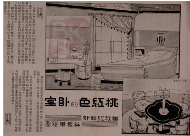
Figure 6. Peach Pink Bedroom.