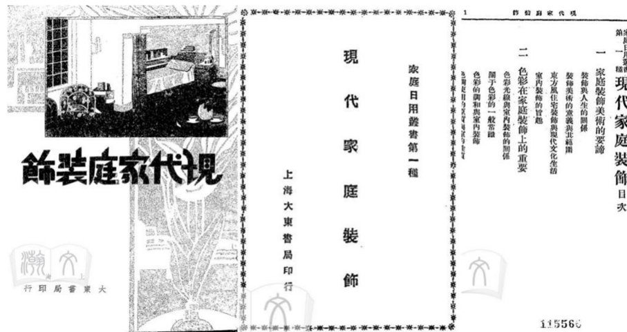
Courtesy of Yan Shi: Modern Home Decoration (Shanghai: Dadao Bookstore, 1933), 1-3.