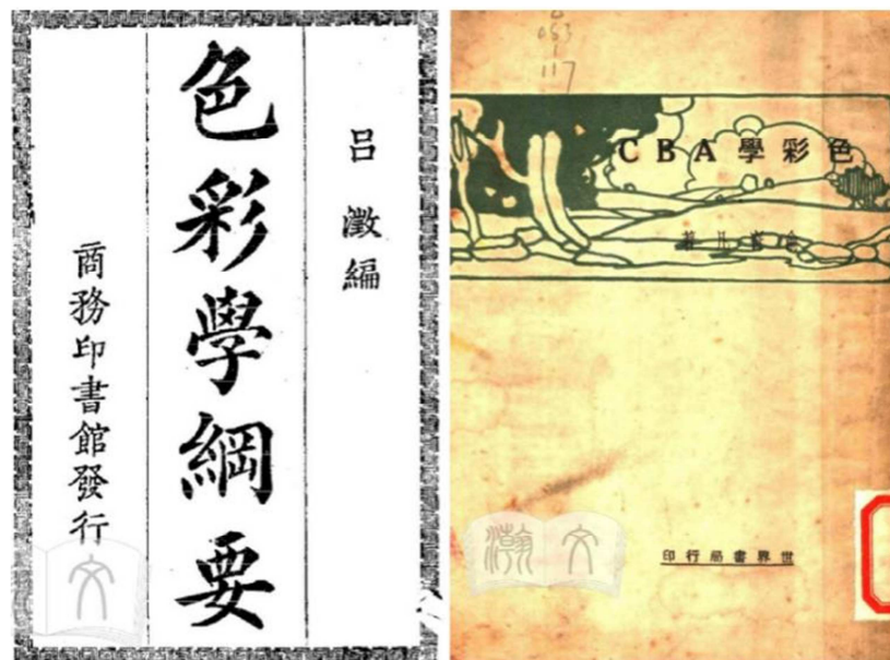
Figure 3. Cover of Colorology and Scientific Quantitative Description and Biological Explanation of Colors .