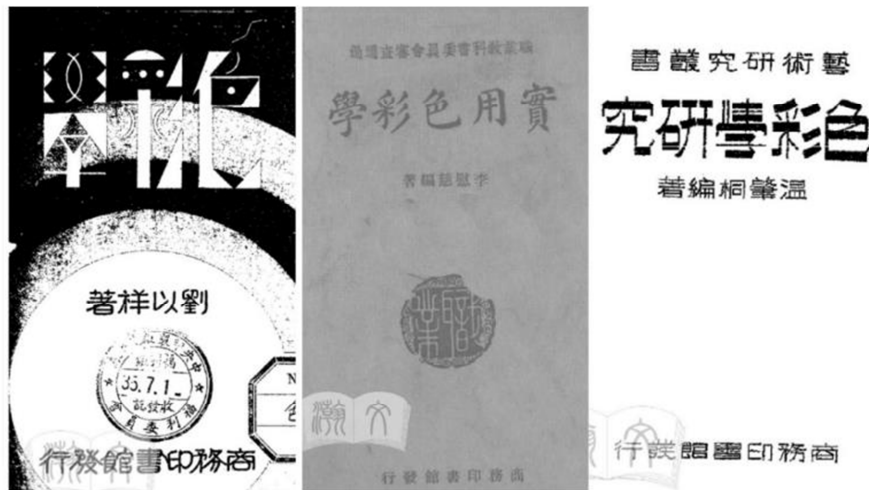
Courtesy of Outline of Color Theory, ABC of Color Theory, Color Theory, Practical Color Theory and Research on Color Theory