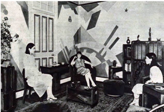
Figure 5. New Residence with Harmonious Colors Designed by Zhong Hong.