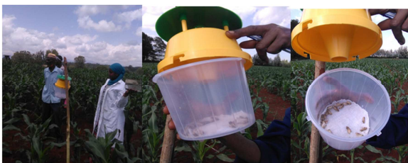
Figure 1. The fall armyworm monitoring kit hanged in maize plot and captured adult moths.

Only one sex pheromone trap was placed inside the maize field at Jimma agricultural research compound for fall armyworm moth detection and control (Figure 1). The source of pheromone trap was obtained from Bako national maize coordinating research center. The trap was hanged from a suspended stick about 1.4 m above the ground (Figure 1). The fall armyworm monitoring kit also contained nylon cloths moisten with diazinon insecticide which immobilized the moths once attracted to the device. The pheromone lure was replaced after 15 days as the trap was hanged for detection for a month. The trap was checked daily (June 20 - July 19, 2017), and trapped moths were then sorted to identify fall armyworm in JARC entomology laboratory.