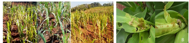
Figure 2. Damaged maize (A) and infested sorghum (B) by fall armyworm. JARC, 2021.

Assessments done on different maize experimental plots (cereal breeding, agronomy, soil acidity, soil fertility and irrigation agronomy) indicated the percentage of fall armyworm ranged from 3.57% to 100% with average infestation of 54.73%, in 2017 growing season. In 2019/20 on late grown maize up to 100 percent crop loss was observed. Similarly, on irrigated maize trial up to 100% crop damage was recorded at same area in 2021 (Figure 1a). Severe infestation due to fall armyworm is expected to decrease yield. In addition to maize crop fall armyworm S. frugiperda infesting sorghum crop in the area (Figure 2b), for this same management option should be implemented as that of maize.