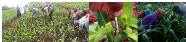
Figure 4. Hand picking of fall armyworm larvae.

early-whorl, mid-whorl and late whorl stage than tasseling and silking stage. Another method used was to adjust time of planting, late planted maize was highly infested than early planted maize in the areas. Besides, effective field inspection of the fall armyworm damage symptom and sign (egg and larvae) on different maize growth stages are important to determine the need, time and type of control measures used.