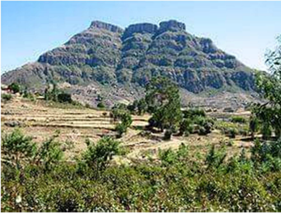
A. View during dry season