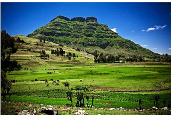
B. View during Rainy season