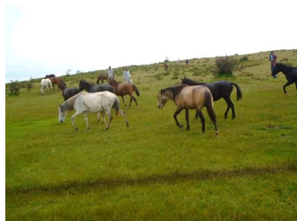
Figure 3. Kundudoo feral horses on the top of the mountain.

As a result of this decline in the number of population, for the last five years, Ethiopian Biodiversity Institute (EBI) and Oromia National Regional State Environment, Forest and Climate Change Authority (OEFCCA) started to work in coordination to conserve Kundudo feral horse breed. As a result of the cooperation of this two organization particularly OEFCCA local branch and EBI local branch, their population