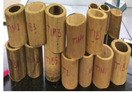
Figure 5. Tikur inchini Bamboo sample for compression.

For compression test 21 specimens from Tikur inchini; 18 specimens from Gurage and 13 specimens from Sidama were taken from the bottom, middle and top part of the bamboo culm with the average length of 70 mm. The diameter and wall thickness of each sample is recorded. The specimens are made ready for testing as shown in figure 5.