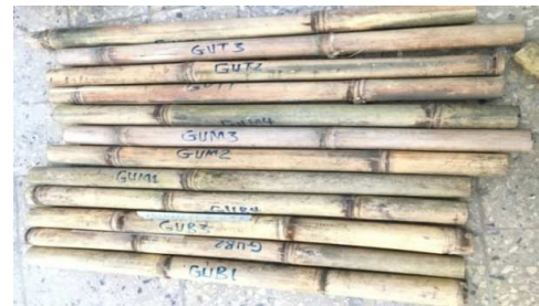
Figure 6. Gurage bamboo samples for bending.

A -is the cross-sectional area in square millimeters ( \text{mm}^2 ).