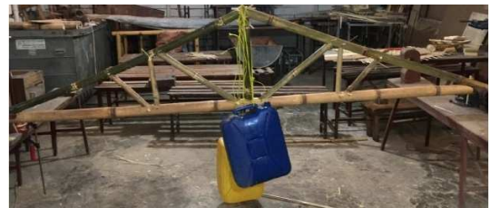
Figure 8. Bamboo roof truss for suitability test.