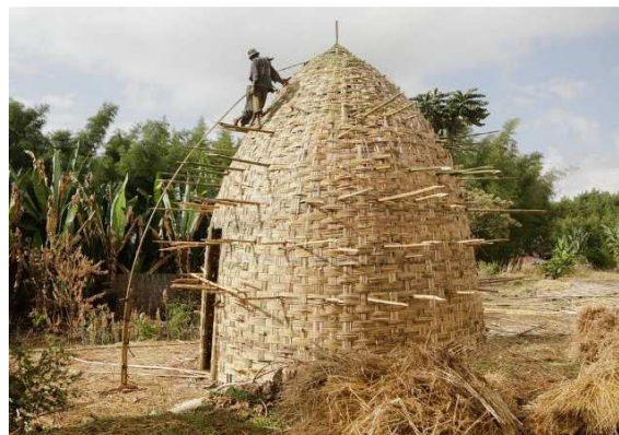
Figure 2. Traditional bamboo house in Ethiopia.