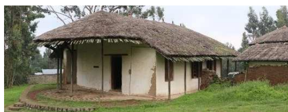
Figure 3. Emperor Minilik II palace at Entoto with bamboo roof truss (Source: https://www.tripadvisor.com/locationPhotoDirectLink ).