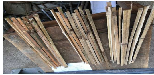
Figure 7. Bamboo samples for tensile.

To test the suitability of bamboo as a roof truss a two dimensional roof truss of 3 meters long was designed using Ethiopian building code for timber and ES 6416 (design of bamboo structures) and assembled using a positive fitting method as shown in figure 8. Then the truss is placed on a standing structure and loaded at the center and supports to test for stability. The material compressive and tensile strength test results and the design load for a G+0 building was compared.