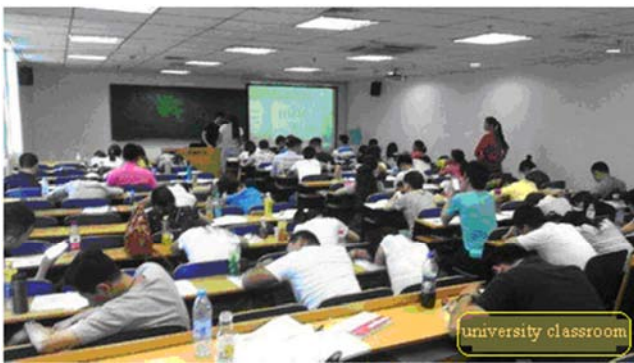
Figure 4. Class status of college students.

chase the entertainment star. In the course of time, this way of relaxation has become a very difficult to reverse the habits of life. Such education, learning, seriously compresses the student's curiosity, crowds out their imagination, results a lack of innovation ability, the country's development and the cultivation of high-end technical talents are also missed. Finally get to the end of the college exam, but also lucky to go to college, their pent up mentality finally released like a broken kite, completely relaxed, but there is no the goal of learning, learning momentum can not come up. Almost 1 / 3 of students lost interest in the study of the university, in the class not bring a book, not bring a notebook, not bring a pen, only bring a mobile phone. As can be seen from the photo of the university class shown in figure 4, people who can listen the course carefully is not many, but sleeping, playing mobile phone is the mainstream of the classroom. This is shown in Figure 3 of the college entrance examination sprint stage formed a great contrast, this situation even many university professors feel helpless.