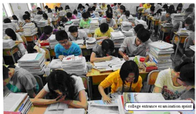
Figure 3. College entrance sprint picture.

Should say, since the reform and opening up, China's education has made rapid development, and has trained a large number of talents for the society. But, everyone should also see, our country in the current education mode, the children from the beginning of kindergarten have already bearing a heavy load, today to have this special class, tomorrow to have also another special class, the parents are also busy awfully. In the primary school, the weight of the bag is close to its own weight of 1 / 3, homework of every day, if the parents do not help, then almost does not finish, even some math problems let parents also feel a headache. This should be happily growing body, but to be pressed across by a heavy task of learning, many students eyes also begin to myopia, almost lost a happy childhood. From the beginning of junior middle school to high school graduation that is ineffable. Get up earlier than the chicken, sleep later than the dog. You can see from the picture of the college entrance examination shown in figure 3, the reference book on the desk of the high school grade three is at least half a meter high, the daily homework, practice almost tired students out of breath, the energy and emotion paid for learning is like the spring of the old clock up to the limit. Even so, learning effect is not necessarily good, the parents are anxious to turn round, hate them self to do not help their children.