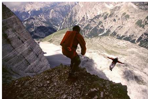
Figure 1. BASE jumping, Wikipedia, available on the website: http://sl.wikipedia.org/wiki/BASE_jumping [cited 23.5.2008].

Image for introductory motivation in learning unit: