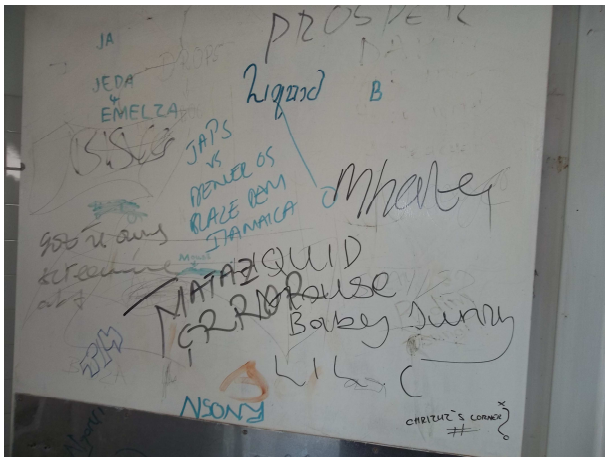
Figure 2. Graffiti inscribed on a toilet stall door.

that there is much more going on in there than the 'normal' physiological relief and freshen up, amongst other otherwise mundane processes. For instance, a look at the various toilet surfaces reveals varying degrees of inscriptions by the students. A close analysis of the inscriptions reveals that the students are actually actively engaged in various issues impacting on their lives. Graffiti constitutes sociocultural literacies that essentially compliments the formal school curriculum in so far as behavioural change is concerned [19, 20]. Figures 1 and 2 below show the sheer volume of the inscriptions on the surfaces.