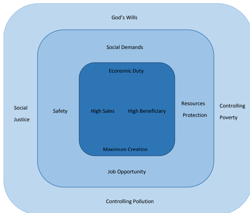
Figure 3. Comparison of the scopes of the three perspectives

Religious and divine judgments on the social responsibility observe and investigate (governmental and non-governmental) corporate and their managers from another angle and by broader and deeper perspective for society. However, based on divine principles and life of the Messenger of God (pbuh) and The Fourteen Infallibles (AS), attention to affairs of society and people is prior to all other things, they have considered such activities not only as an aim but also a means of pleasing God and human closeness to God. In other words, this approach insists on values such as freedom, justice, social equality and human dignity as they have been stated in Sharia law (Nicomaram and Mohammedan Saravi, 2010).