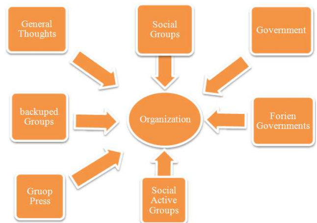
Figure 2. Model of secondary interactions between corporate and society

While in Figure 2, it can be observed that relationships between corporate and society are beyond working and commercial relations and some groups and individuals who can be considered as beneficiaries are affected by actions and operations of the corporate (Nicomaram and Faizabadi, 2010). In addition to the primary interaction, for survival and stability, corporate require another interaction that guarantees and maintains their stability. This model emphasizes that decision-makers of the corporate should act so that they improve the general welfare of the society along with the preservation of the interests of the corporate. One of the features of social responsibility is that all beneficiaries should be considered and beneficiaries are those who have relation with various corporate as well as with each other.