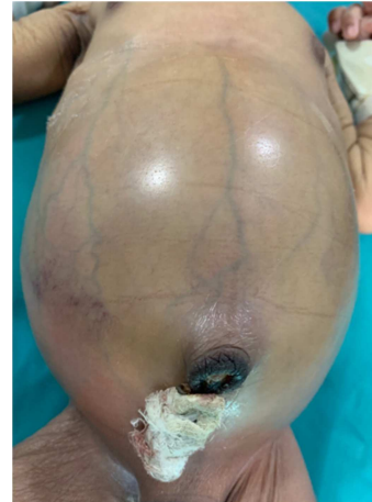
Figure 1. Abdominal bloating (HPKL).