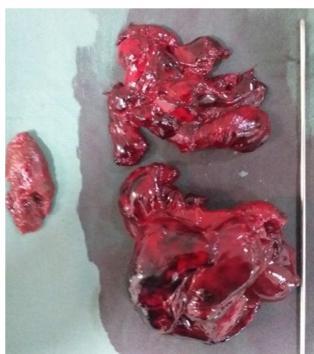
Figure 5. Parts of the spleen and the 2 large subcapsular hematomas (HPKL).