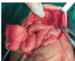
Figure 6. Splenic compartment after total splenectomy (HPKL).