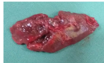
Figure 3. Hilar face laceration (HPKL).