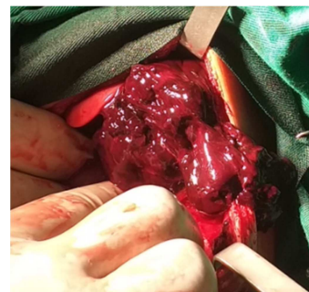
Figure 4. Subcapsular hematomas in the splenic space (HPKL).